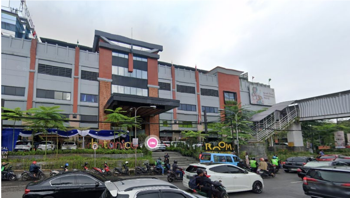
Front view of BTC Mall, ROOM Inc hotel is located behind the mall. Rooms Inc. Hotel address: Jl. Dr. Djunjunan No.143-149